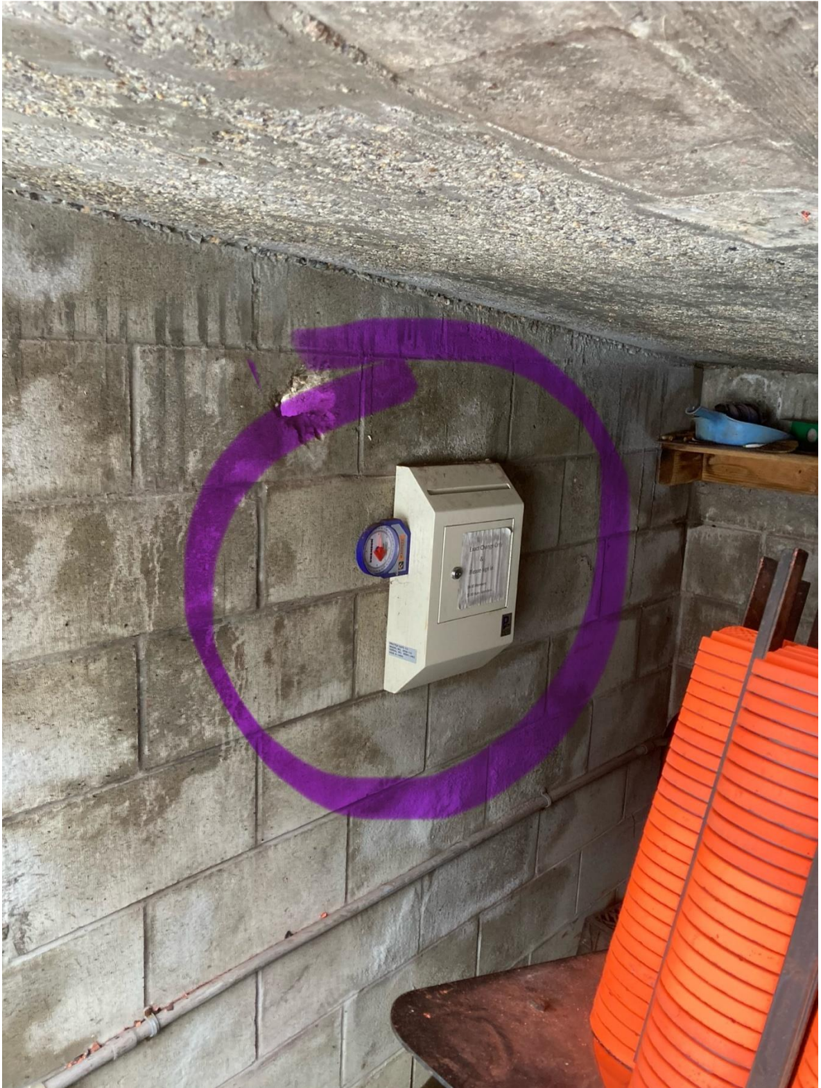
6. Secure doors and lock them