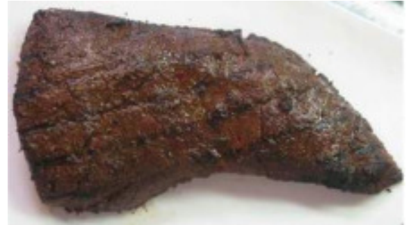
Can you say, "Hmm, Medium rare"?

Come on out and bring your friends. These are the BBQs under the MRGC pavillion that you'll want to come back to. $15 gets you an old school delicious feast cooked by the legendary charcoal grillers of MRGC. You don't want to miss this! Sirloin, homemade mushroom sauce, baked potato, corn on the cob, grilled onions and peppers and salad. Are you hungry yet? You can't go wrong (unless you don't eat steak)! Cash bar. Bring your appetite and bring your friends.