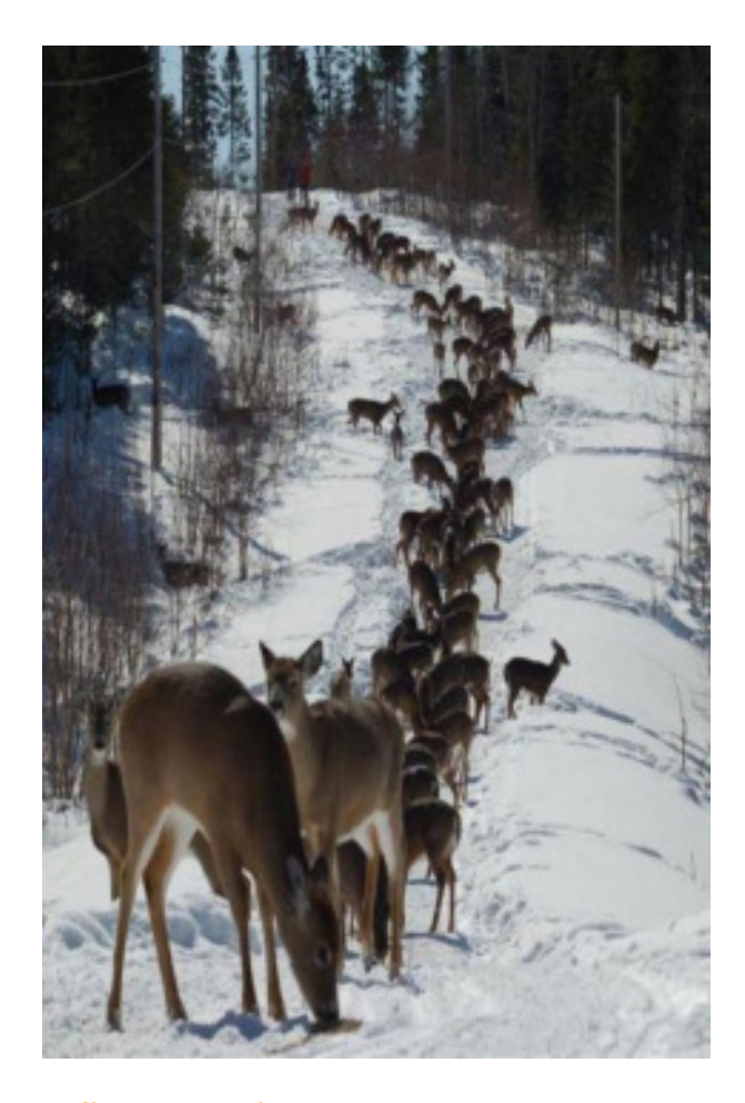
Rifle & Pistol Committee

News from the rifle and pistol committee.